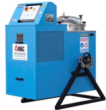
ALPHA 200 main unit