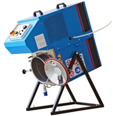
ALPHA 50 main unit tilted for unloading